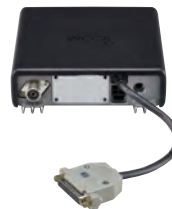
Optional OPC-2078 installation image